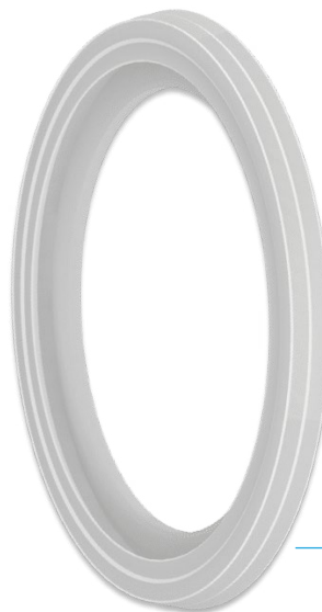
Alpha port Easyglide™ seal

The ABC Transfer revolutionary seal has been designed to improve leak tightness, simplify maintenance, and increase operator safety. It is available on ABC Transfer's Alpha ports, Beta containers and single-use bags.