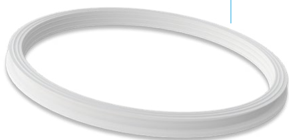
Beta container & single-use bag Easyglide™ seal

A PERFECT MATCH FOR STERILE AND HIGH POTENT APPLICATIONS